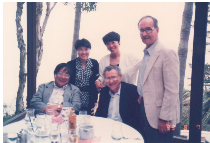
With colleagues at University of California San Diego (Mar 7, 1993)